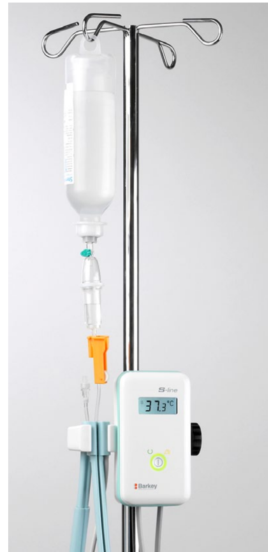
The accessories shown are not included in delivery.